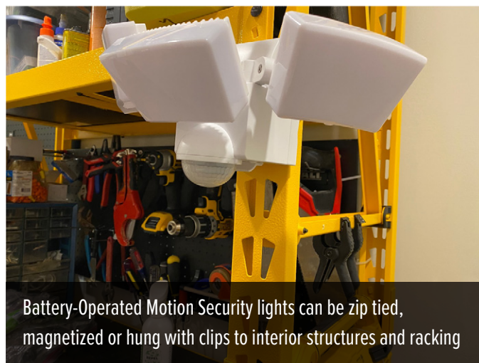
Battery-Operated Motion Security lights can be zip tied, magnetized or hung with clips to interior structures and racking

controls and lumen levels as their 120V counterparts.